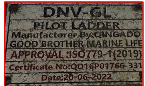
Figure 1: Fraudulent Certification Placard

Marine Inspectors from Sector Maryland-National Capital Region (NCR) discovered counterfeit pilot ladders during a Port State Control Examination at the Port of Baltimore. The identification plate on the ladder (Figure 1) contained several errors, including referencing ISO 779-1 instead of the correct standard, ISO 799-1, and lacking the ISO 799-1 designation type. Additionally, while the serial number on the ladder matched the accompanying certificate, the number of steps and the length of the ladder did not align with the specifications listed on the certificate.