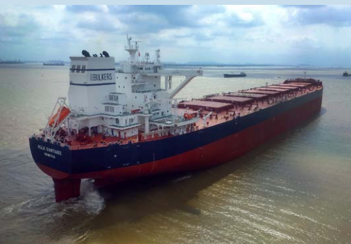
Welcome aboard to the 107,879 GT bulk carrier BULK SANTIAGO. The vessel was built by New Times Shipbuilding Co. in China and delivered to 2020 Bulkers this past September. Welcome!