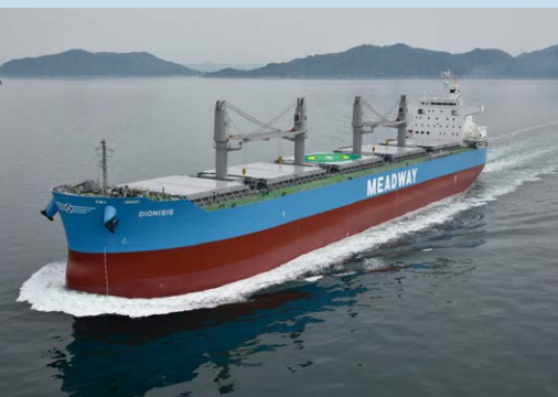
The Liberian Registry welcomes DIONISIS. Meadway Shipmanagement Inc. of Greece has taken delivery of the 35,842 GT bulk carrier from Japan's I-S Shipyard Co. Ltd. Welcome to the fleet!