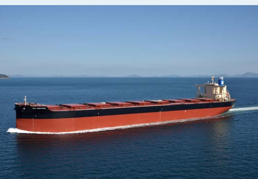
The 108,100 GT bulk carrier, NSU AMBITIOUS, built by Imabari Shipbuilding Saijo in Japan for NS UNITED KAIUN KAISHA joined Liberia's growing fleet. Welcome!