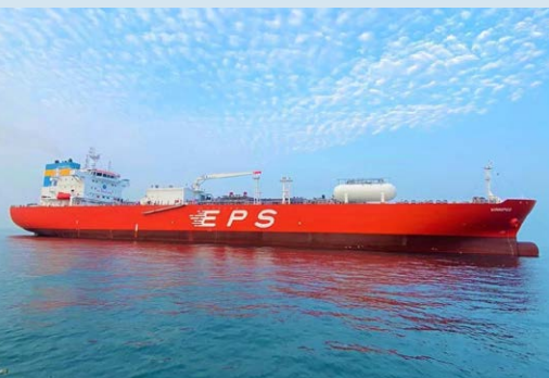
The Liberian Registry welcomes the 25,167 GT liquefied gas carrier WINNIPEG, built at Hyundai Mipo Dockyard Co., Ltd., and operated by Eastern Pacific Shipping in Singapore. Welcome to the fleet!