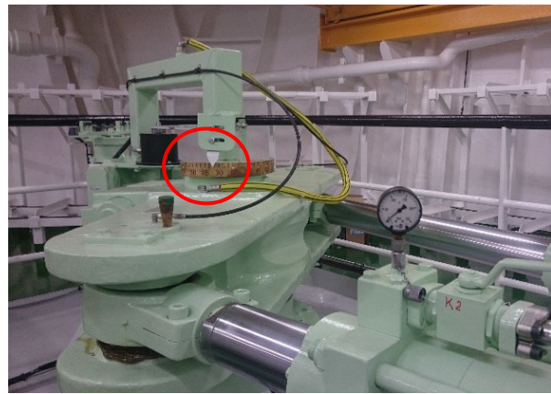
Actual Position of the Rudder

All queries related to this requirement shall be sent to the PPA Port Hedland Marine Team (PPAshipman@pilbaraports.com.au).